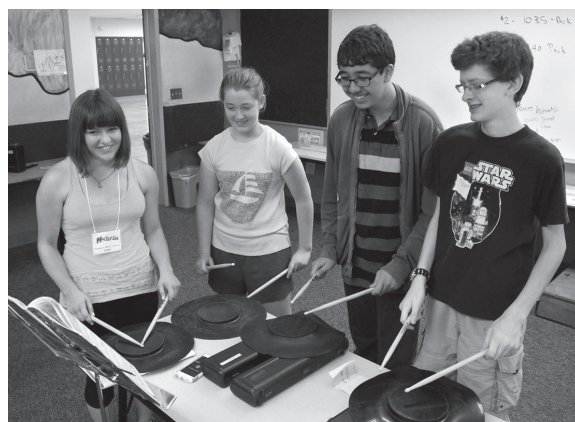
Students practice percussion for the Fourth of July Parade in Edmonds.