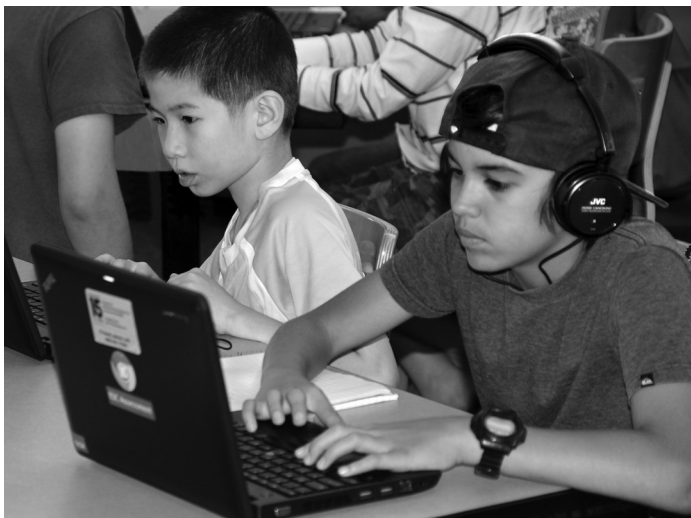
Students utilize online programs in the Summer Math Programs.