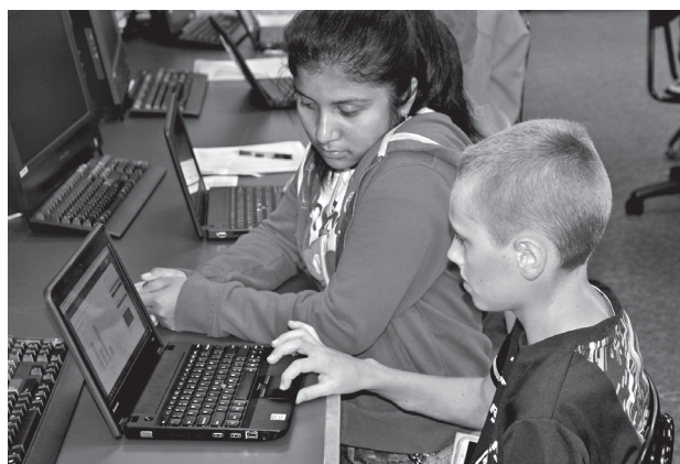
A Summer Math Program student works with a student volunteer.