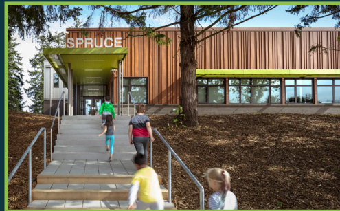
The district completed Phase 1 in September 2019.