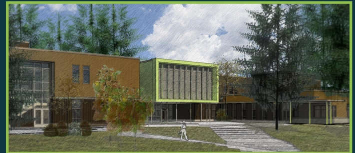
If voters approve the capital levy, Phase 2 of construction would begin spring 2021.