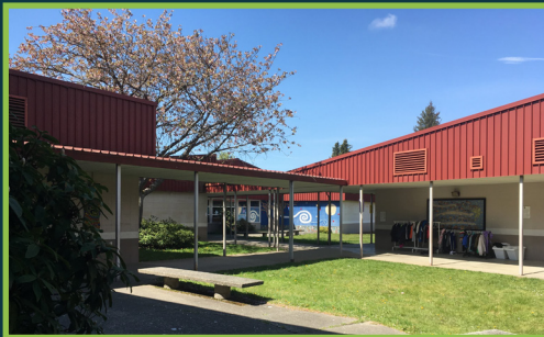
Spruce Elementary, before Phase 1 completion.