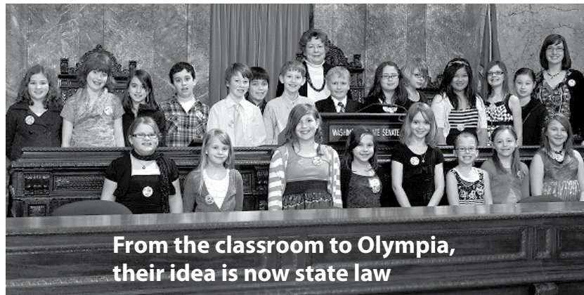
From the classroom to Olympia, their idea is now state law

The opportunities this afforded for students to learn more about the legislative process were endless. The students participated in a hearing through a conference call in early February, and