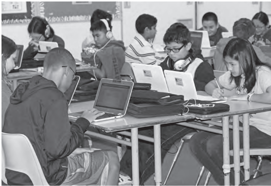
Students at Brier Terrace Middle use Chromebooks in Algebra 1 class.