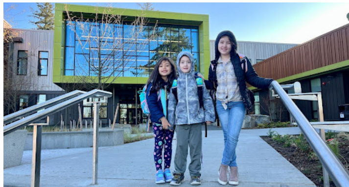
Spruce Elementary students are all smiles about their new building.

Up next, early in the new year, the School Board will review proposed district-wide Elementary Educational Specifications that guide the design process.