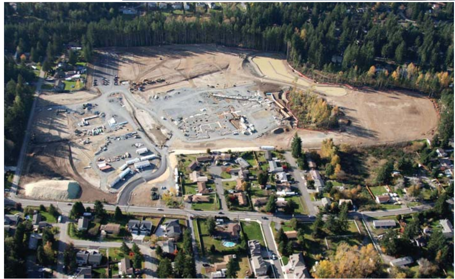
Top Photo: The first wall of the Central Gathering Area went up in early November 2007. Bottom Photo: A current aerial view of the entire construction site.